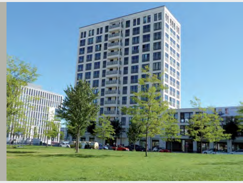
Panorama Tower – economic and efficient vibration and sound insulation