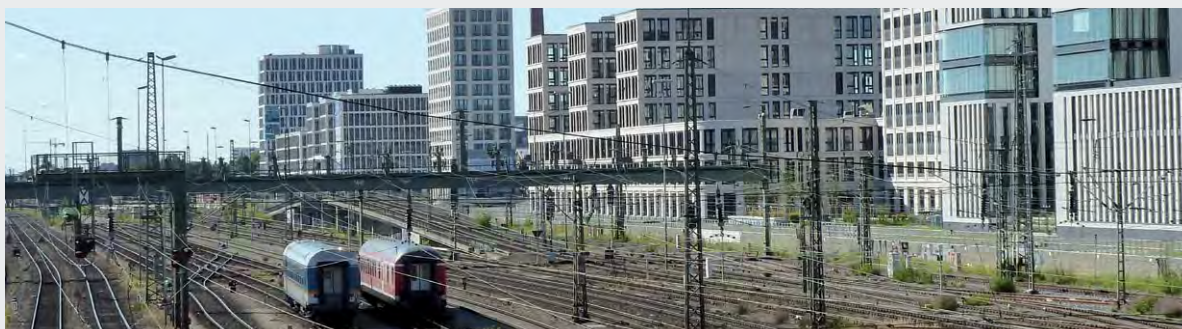
The main rapid transit line runs immediately next to the Panorama Towers