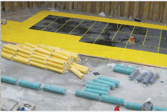
Professional building protection using Sylomer® and Sylodyn®